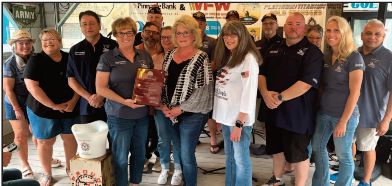
Pinnacle Bank received a plaque for their continuous support over the years. The 5k race committee is also pictured.