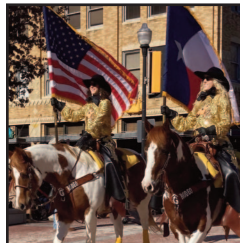
The parade began with the American and Texas flags!