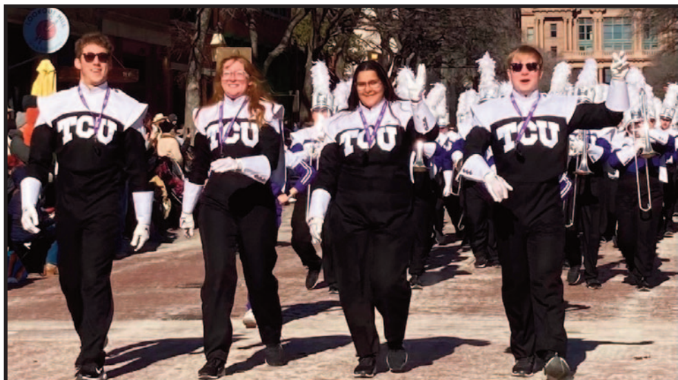
The TCU Marching Band.

Overall, the event was enjoyed by everyone who attended!