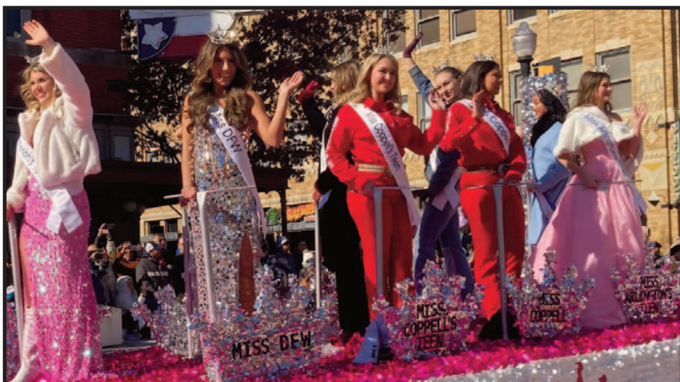
Contestants from the area vying for the title of Miss Texas and Miss Texas Teen.