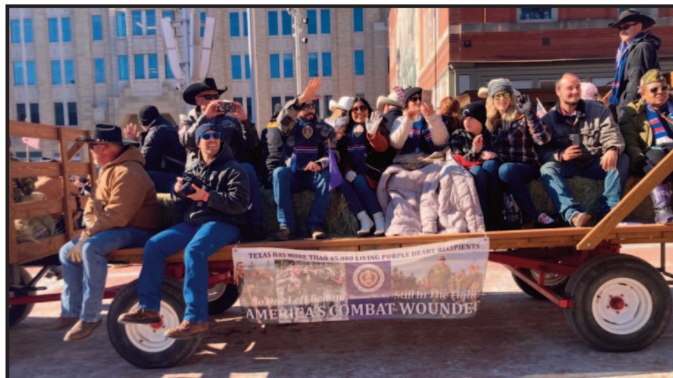
Recipients of the Purple Heart.