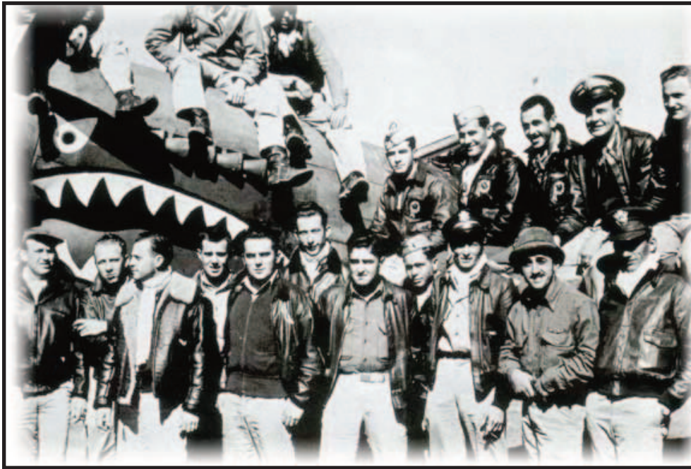
1st American Volunteer Group - Flying Tigers.

The Flying Tigers were one of the first American air units to fight the Japanese as World War II began. A gruff Texas native, Claire Chennault organized the volunteer force in the months before the United States entered the war. His determination and the success of his pilots drew the attention of the world to an almost forgotten corner of the global conflict. Chennault's Flying Tigers helped lay the foundation for the defeat of the Japanese in China.