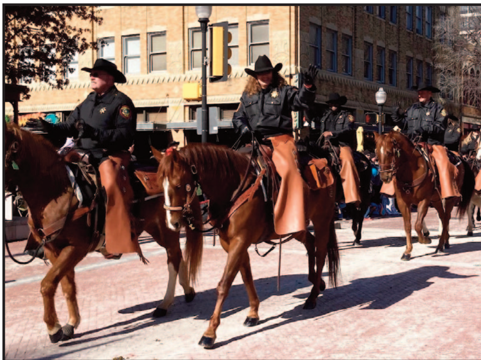
Tarrant County Sheriff's Posse.