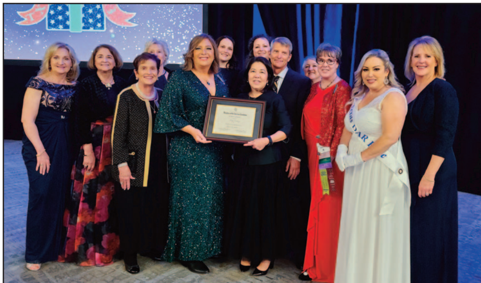
Fort Worth Chapter members of the National Society Daughters of the American Revolution at the State Conference in Dallas.