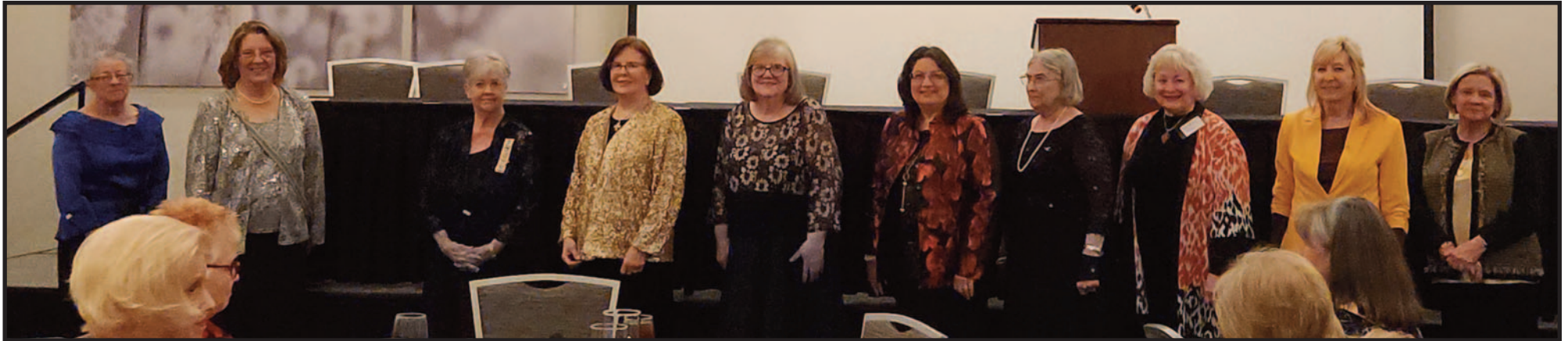
Pictured above: The new State Board members at the Assembly.