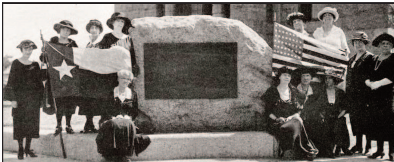
Pictured below: Mary Isham Keith Chapter members at the Marker Dedication in 1921

If you are interested in learning more about DAR membership, email mikregent2025@gmail.com .