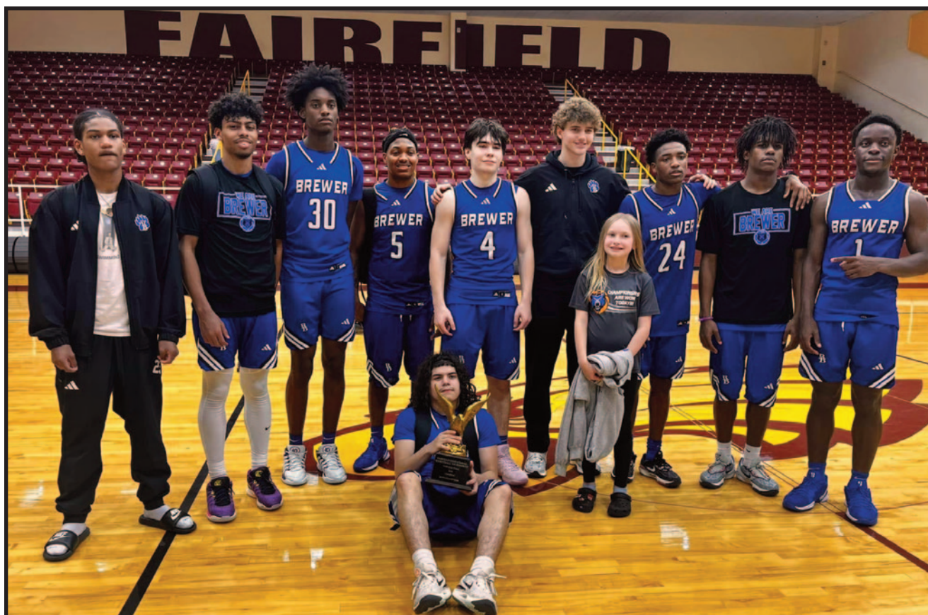
After 12 hours on the road in three days, the Brewer boys basketball team won the Fairfield Tournament Championship.