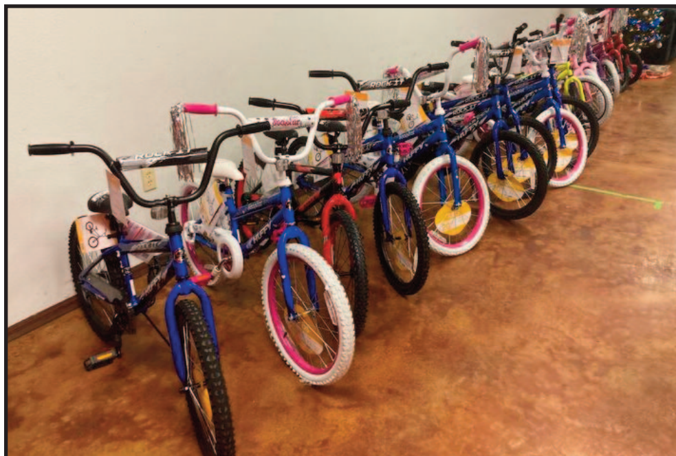
Pictured above: Bicycles await excited children to take them for a spin.