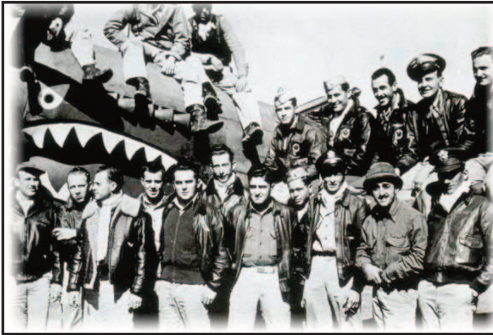
1st American Volunteer Group - Flying Tigers.

The Flying Tigers were one of the first American air units to fight the Japanese as World War II began. A gruff Texas native, Claire Chennault organized the volunteer force in the months before the United States entered the war. His determination and the success of his pilots drew the attention of the world to an almost forgotten corner of the global conflict. Chennault's Flying Tigers helped lay the foundation for the defeat of the Japanese in China.