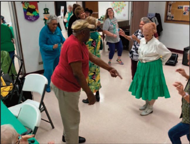
Several seniors displayed their dancing skills at the affair.