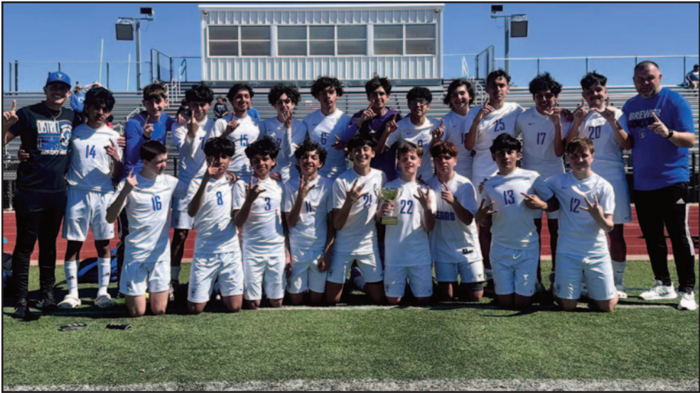
Brewer Bears JV Boys Soccer Team is the undefeated Tournament Champion of District 5-5A.