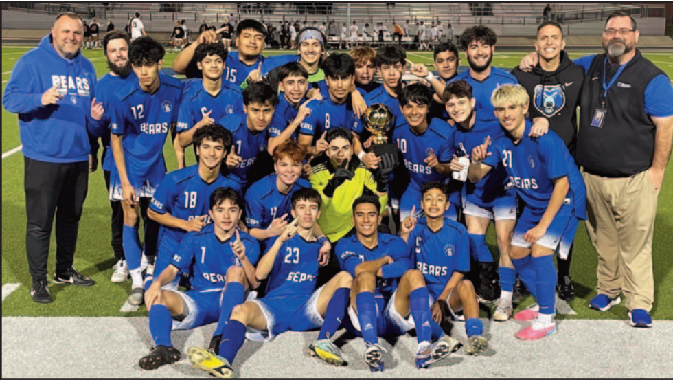
For the first time in Brewer High School history, Brewer Boys Soccer won the District Championship! The team claimed the 5-5A District Championship with a 4-1 victory over Aledo.