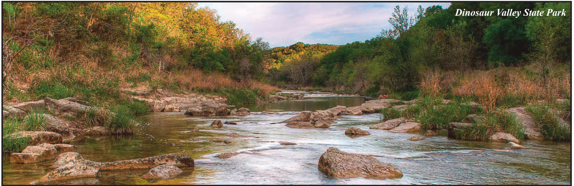
Dinosaur Valley State Park

For Texans looking to explore the outdoors without stretching the family budget, several annual free-admission days offer opportunities to visit both Texas state parks and America's national parks at no cost.