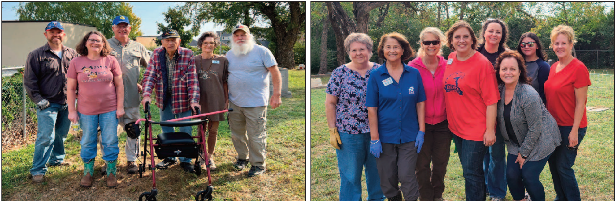
Pictured: members of the White Settlement Historical Society. Pictured: members of the Fort Worth Chapter DAR.