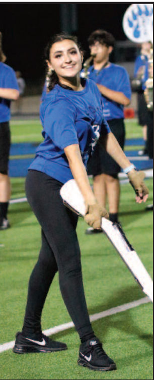
Color Guard performers shine on the field during halftime.