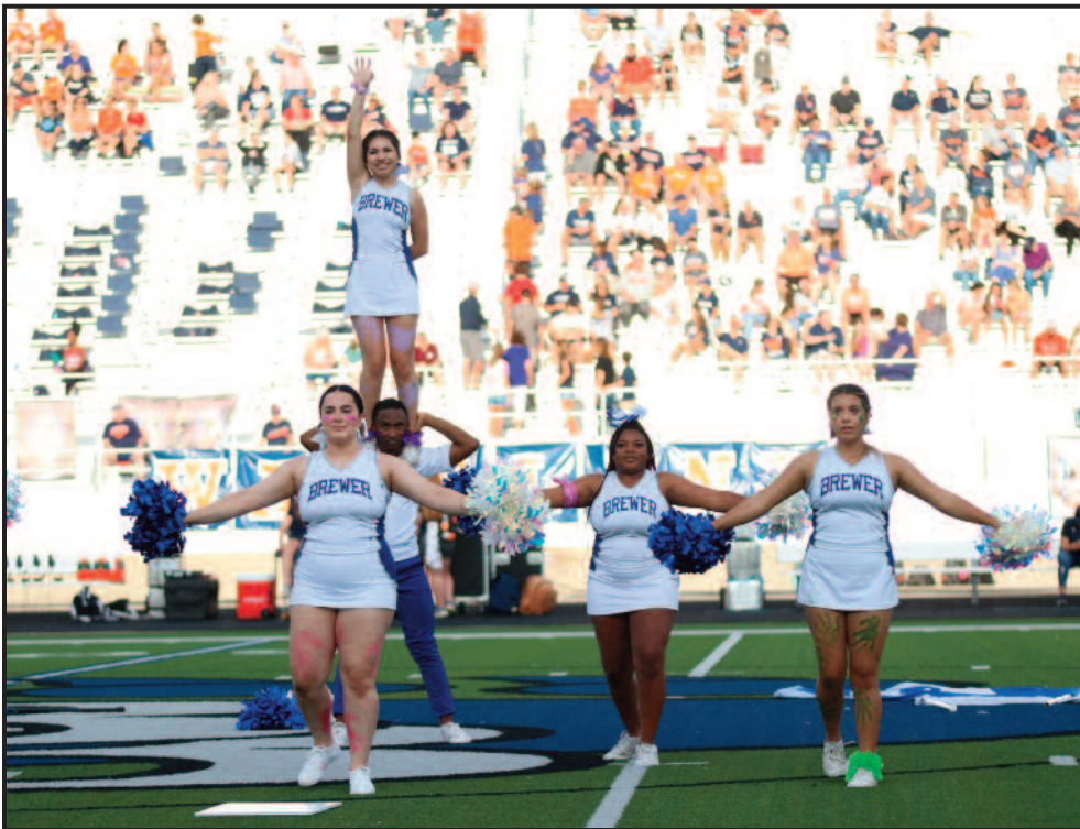
Cheerleaders get the crowd pumped!