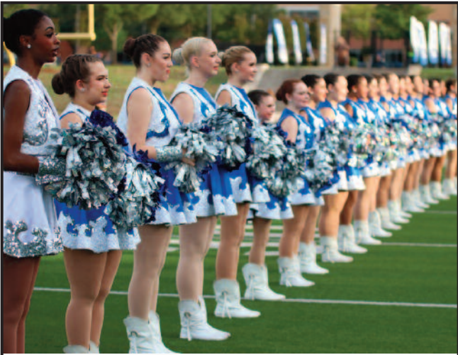
Brewer Honeycombs stand in pre-game lines before the Bears run through.