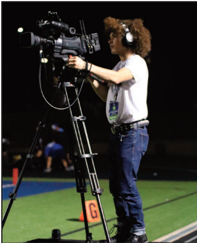
Audio/Visual students record the plays at the Fightin Bear Stadium.