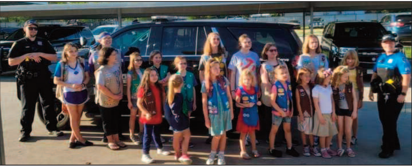
Girl Scouts from Troops 2508, 2518, 2528, 2578, 2588 and 2598 toured the White Settlement Police Department recently. Troop members learned about the roles of a police officer and brought cookies to show their appreciation.