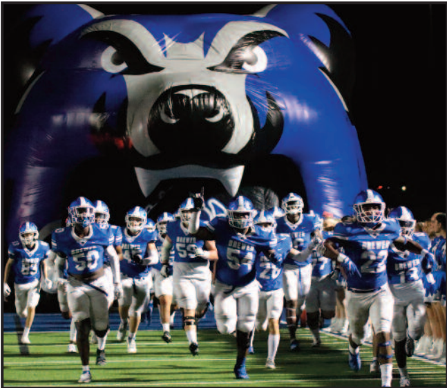
The Varsity Brewer football team takes the field at Bear Stadium.

Brewer will open up district competition at 5:30 p.m. tomorrow night at Granbury.