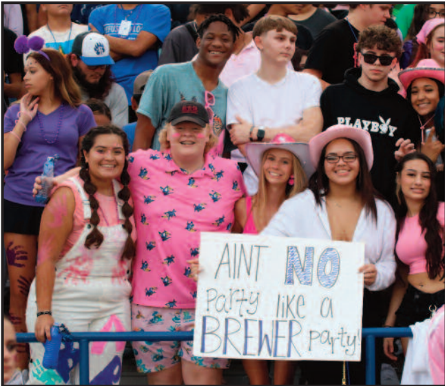
Loud and proud Brewer Bear supporters filled the stands.