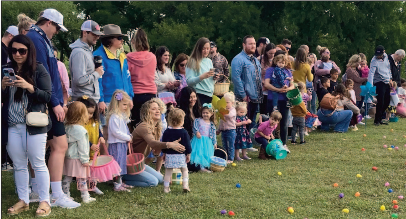
The weather was perfect for Easter Egg Hunts all over the community.