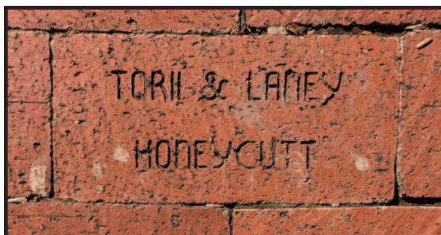
These engraved bricks were sold as fundraisers for Castle Park in the 1990s.

We Want to Hear From You! Send Us Your Good News! suburbannews@sbcglobal.net