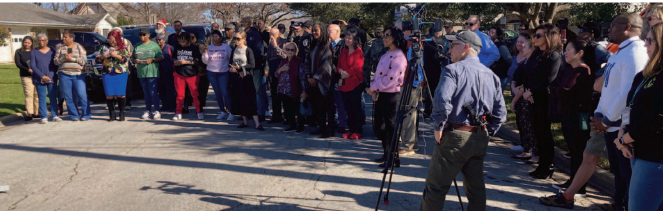
Pictured left: A large crowd gathered to witness the street topper unveiling.