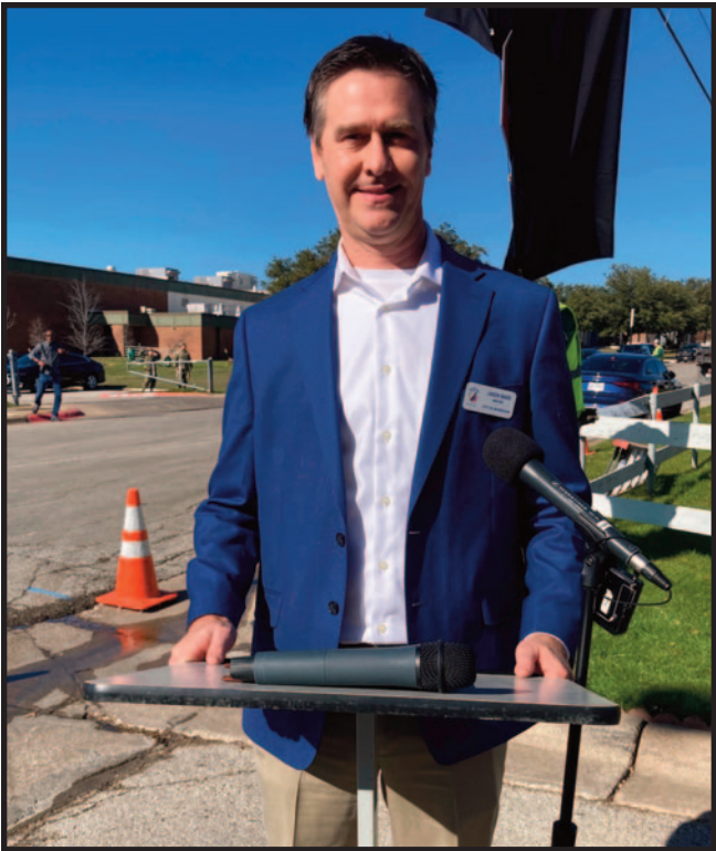
Benbrook Mayor Jason Ward spoke at the occasion.