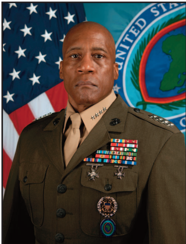
4-Star General Michael E. Langley, USMC.