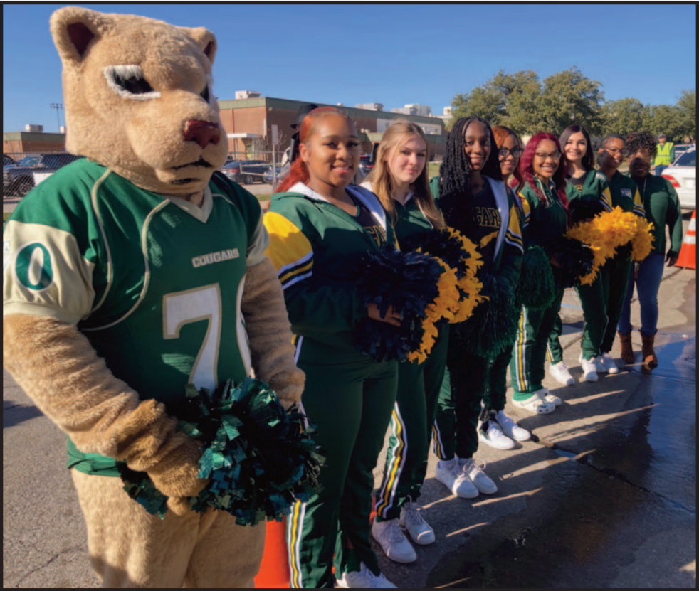
The Western Hills High School Cougar Mascot and Cheer Squad supported the affair.