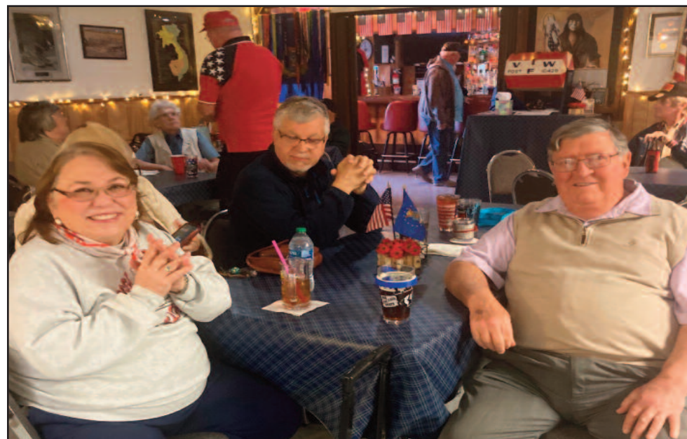
Several individuals enjoyed the event.