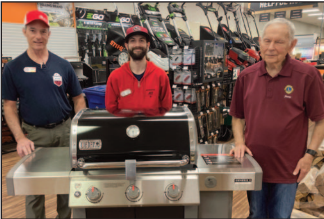
Benbrook Ace Hardware donated a Weber Genesis II E-315 BBQ Grill that was part of the live auction at the Benbrook Lions Club Chili Supper Fundraiser.