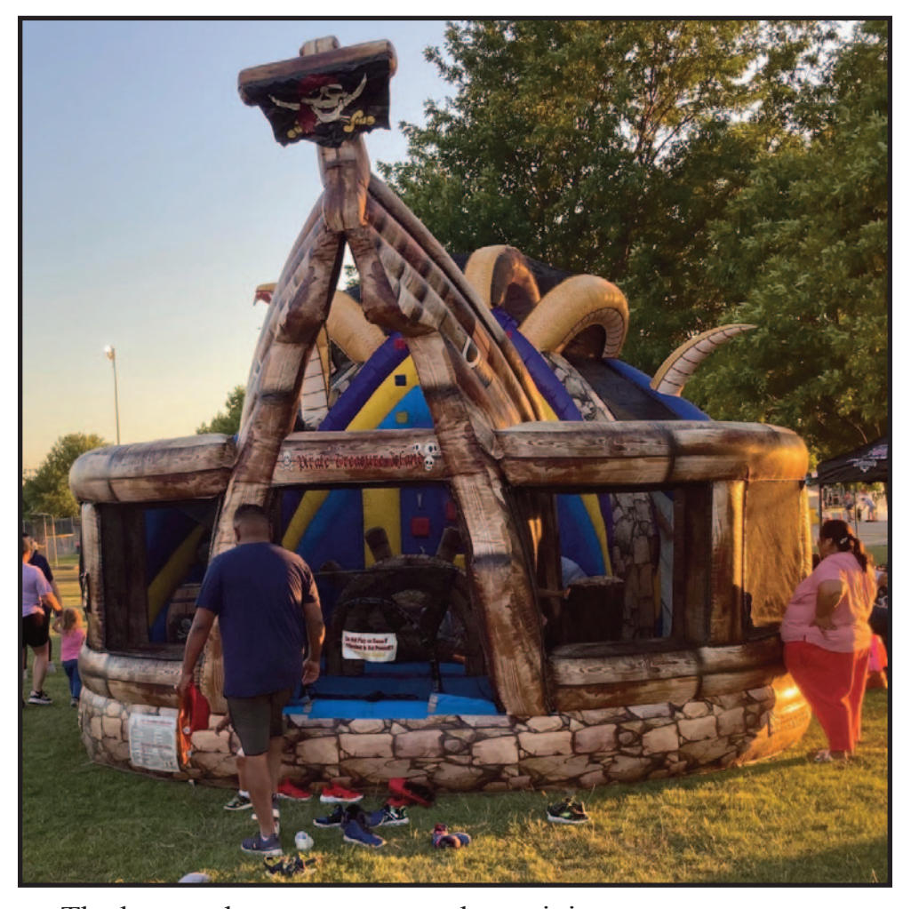
The bounce house was a popular activity.

4PAWS Pet Adoptions at Benbrook Animal Shelter - 469 Winscott Rd. Tuesday, Wednesday & Friday: 10 a.m. - 3 p.m. Saturday: 10 a.m. - 2 p.m.; Sunday: 11 a.m. - 3 p.m.