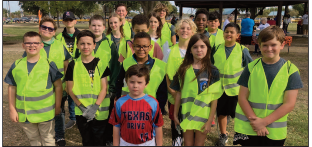
JCC members from Benbrook Middle school came out to support the event.

Benbrook residents, visitors, groups and organizations gathered behind the YMCA to volunteer and take part in a fun cleanup party on Saturday, Oct. 21. The event began at 9 a.m. and volunteers were assigned to specific areas in the park to pick up litter and debris. Supply bags were distributed with safety vests, gloves and trash bags. Prizes were awarded and a free hot dog lunch was served to all those who participated. The event was a huge success and enjoyed by everyone who came out.