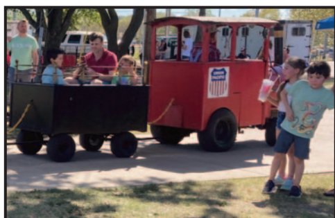
The choo-choo train was a popular event for the day.

Benbrook's Annual Heritage Fest was held on Saturday, Sept. 30 at Dutch Branch Park. The event offered many attractions and was enjoyed by all!