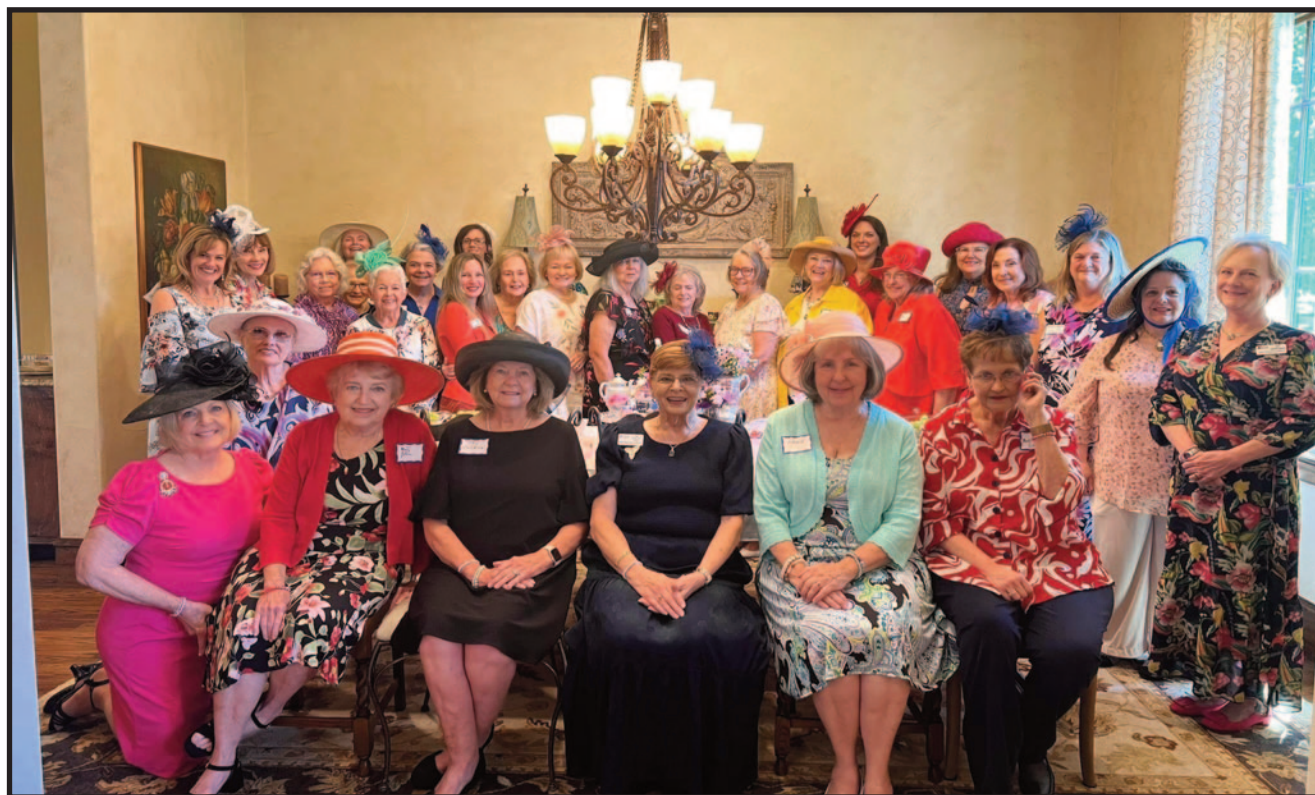
Mary Isham Keith Chapter members and prospective members don fancy hats for the Friendship Tea group photo.