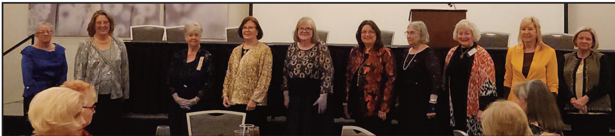
Pictured above: The new State Board members at the Assembly.